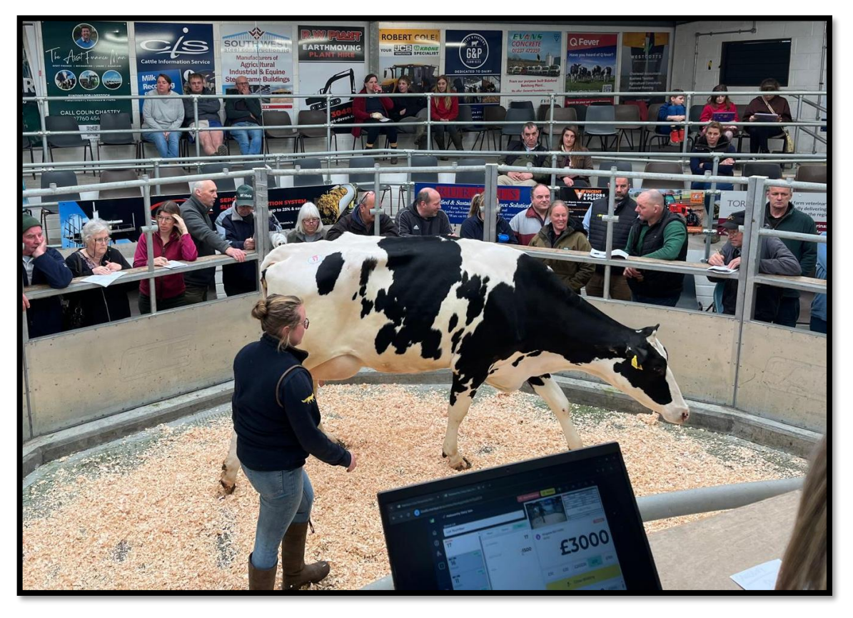
Topping today's dairy sale at £3100 was a 2nd calving cow 'Littlweir Redcarpet Unice' yielding 39Kgs on behalf of Messrs J & SW Murch of Umberleigh